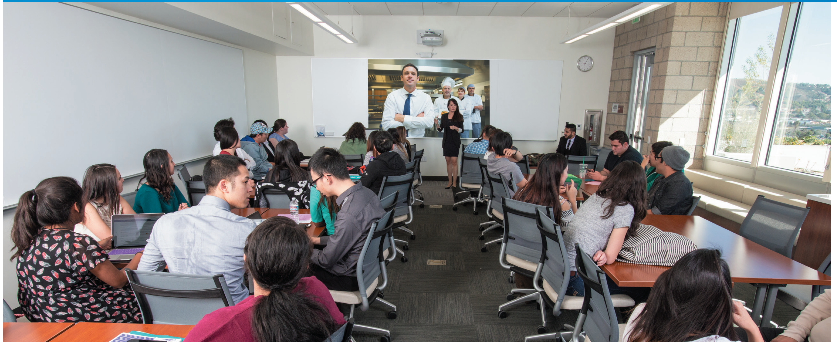
IDEA Panoramic screens in a lecture room at CCHM.