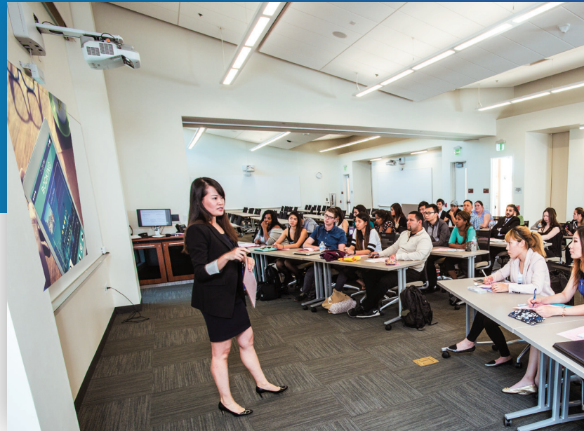
IDEA Panoramic screens in use at the Marriott Learning Center