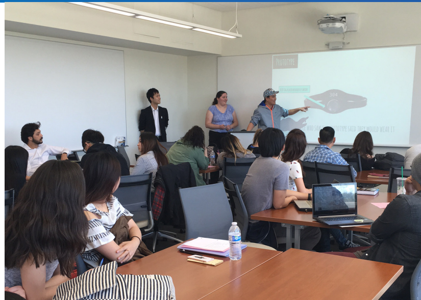
Hospitality Management students use projection interactivity features of IDEA screens in one of the CCHM instructional support rooms.

There isn't a clear front or back to the nontraditional classrooms in the Marriott Learning Center. Instead, the instructor is aided by the AV technology seamlessly integrated into an open and changeable floorplan. Three walls feature the IDEA Panoramic screens. The fourth wall is a manually operated air door that can be opened to reveal space that mirrors the layout on the other side. Depending on class size and needs, either three or six IDEA Panoramic screens can be utilized at one time.