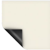
HD Progressive 0.9