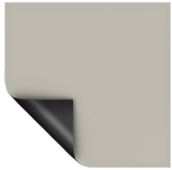
HD Progressive 0.6