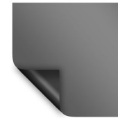
Parallax Stratos 1.0