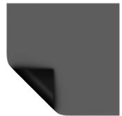
Parallax Pure 2.3