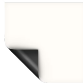
HD Progressive 1.3