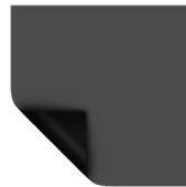
Parallax® Pure 0.8