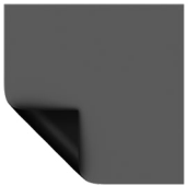
Parallax Pure UST 0.45