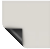
HD Progressive 1.1 Contrast