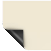
HD Progressive 1.1