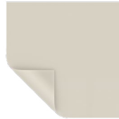
Ultra Wide Angle