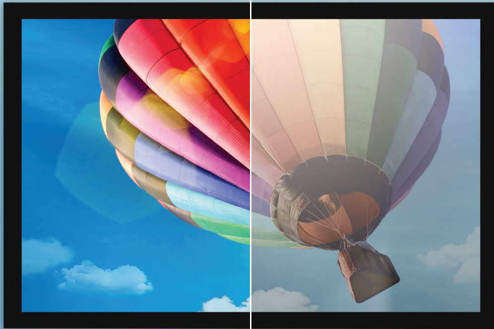
ambient light rejection technology