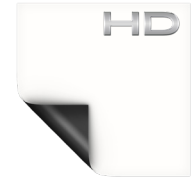
HD Progressive 1.3 Half Angle: 75° Gain: 1.3