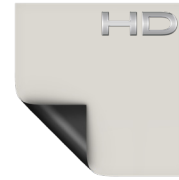
HD Progressive 1.1 Contrast Half Angle: 60° Gain: 1.1