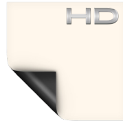
HD Progressive 1.1 Half Angle: 85° Gain: 1.1