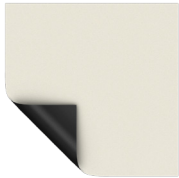
Da-Mat Half Angle: 60° Gain: 1.0