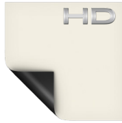
HD Progressive 0.9 Half Angle: 85° Gain: 0.9