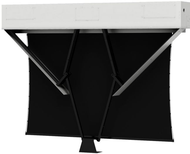
Back of Screen